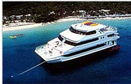
Aqua Cat Cruises - Leisurely Liveboard scuba diving and snorkeling adventure vacation in the Bahamas.

Trip fee will be $2095 per person, we can add a 3rd or 4th person in one of the cabins for $1295. There are additional fees for taxes, tip and service fees which add approximately $550 per person. The AquaCat fees include the trip, food, beverages/bar & snacks on board and diving. These fees do not include air fare to Nassau or dinner ashore on Friday evening on the last night.