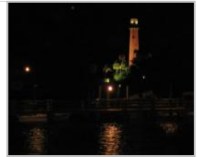
While not diving, we all enjoyed dinner at the Crab House; great food with a view of the lighthouse.

Friday: On Friday we had a relaxing drive down to Orlando where we toured The Living Seas and learned some about conservation and what Disney is doing to help out. Did you know that the small cost to dive The Living Seas all goes to wildlife conservation? After the tour we suited up and dove Dive Quest. A 40 Minute dive with interaction with abundant sea life and lets not forget the families that are eating diner in the restaurant. The kids just love interacting with the divers. Afterward, we hit the road bound for Palm Beach.